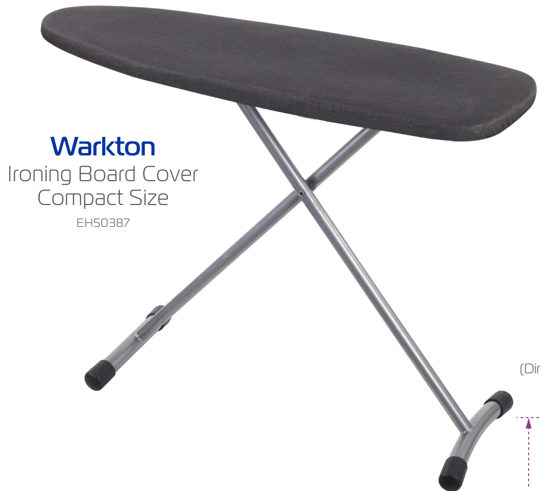
Warkton Ironing Board Cover Compact Size EH50387